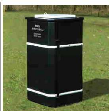
proposed hot ash bin