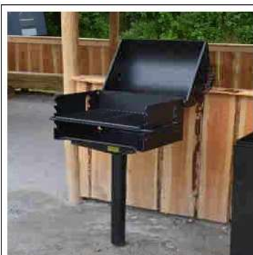
proposed Pilot Rock park grill, with lid