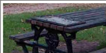
metal plate fitted to picnic table in Victoria Park, Bath