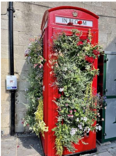
a planted telephone box in Glastonbury.